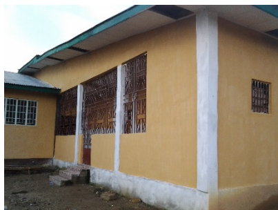
Entrance to Isolation Wards

The Isolation Ward has now been completed and the opening ceremony will take place shortly, including dignitaries represented from Bo and Freetown. Work will continue to be carried out on the fit out of the laboratory and the pharmacy. We are indebted to our wonderful donors who have made this a reality.