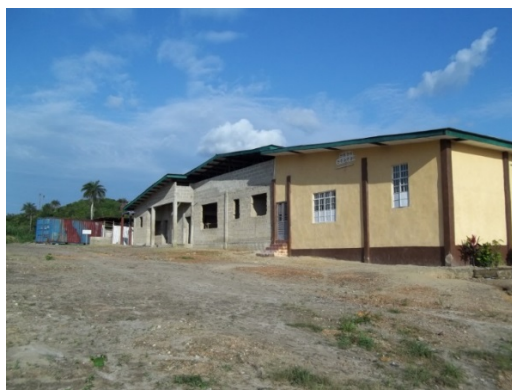
Side view of work in progress section now requiring solar panels