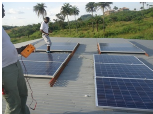
Solar panels on original building

We are currently seeking further funding for solar panels on the new fit out section to help with the difficulty of servicing the hospital continuously for 24 hours with generators.